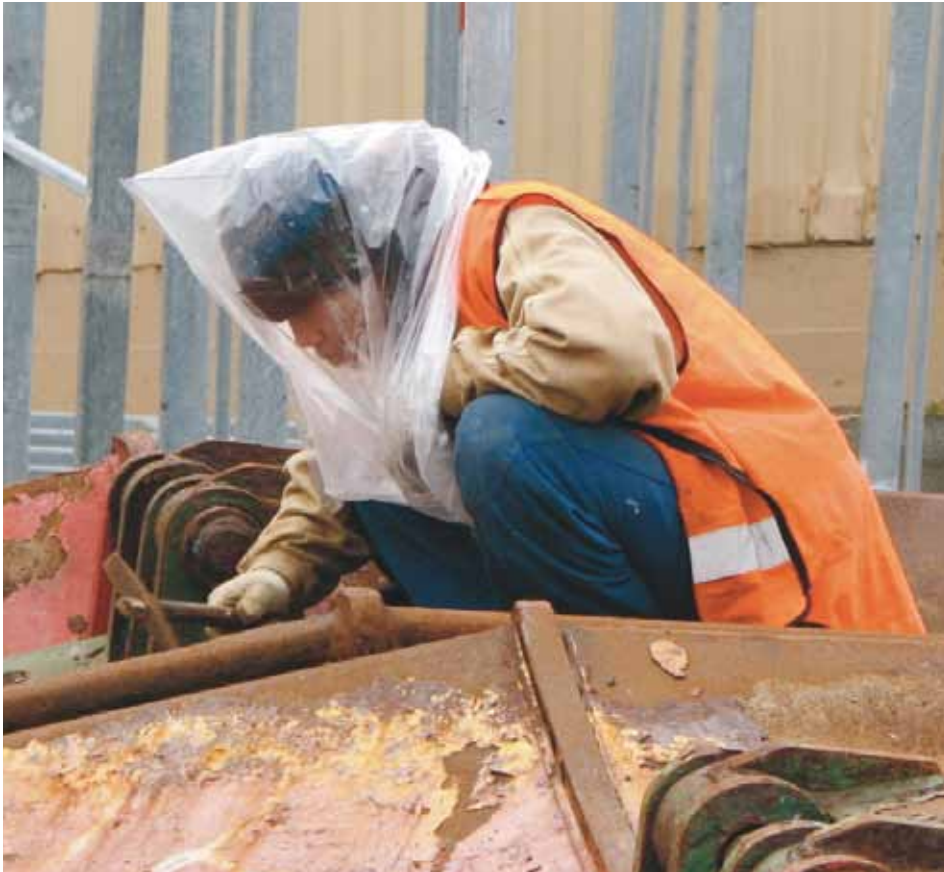
A Korean fishing crew member uses a plastic bag over his head as "safety gear" while working on a vessel at the Port of Bluff, February 2010.