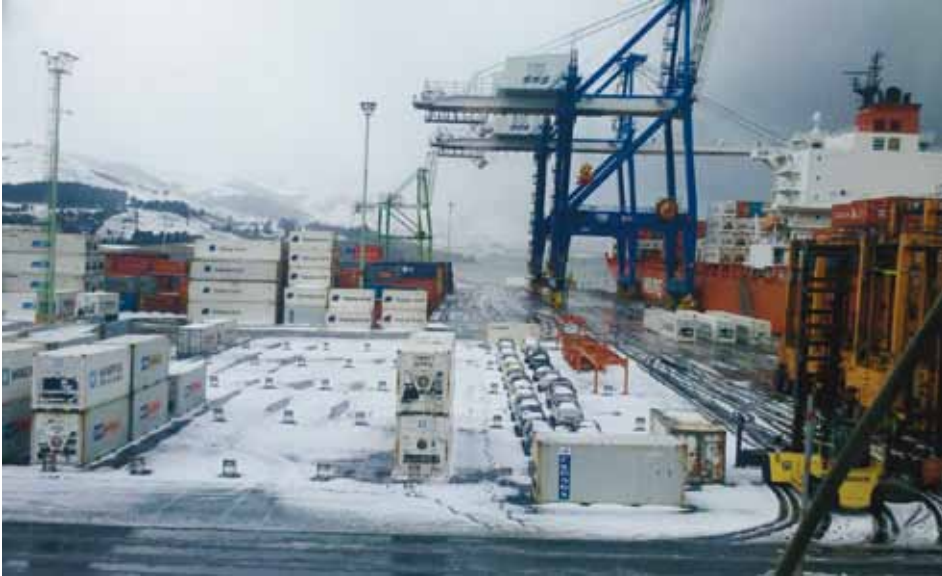
Snow blankets the Port Otago terminal during the big winter storms of August 2011