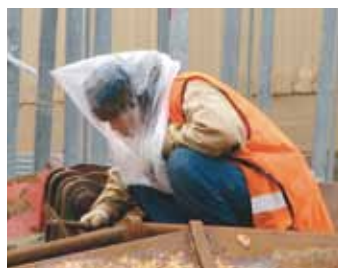
Fishing industry under investigation page 8