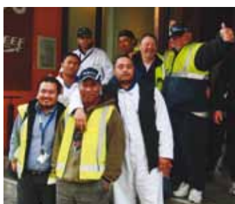
Branch reports page 20