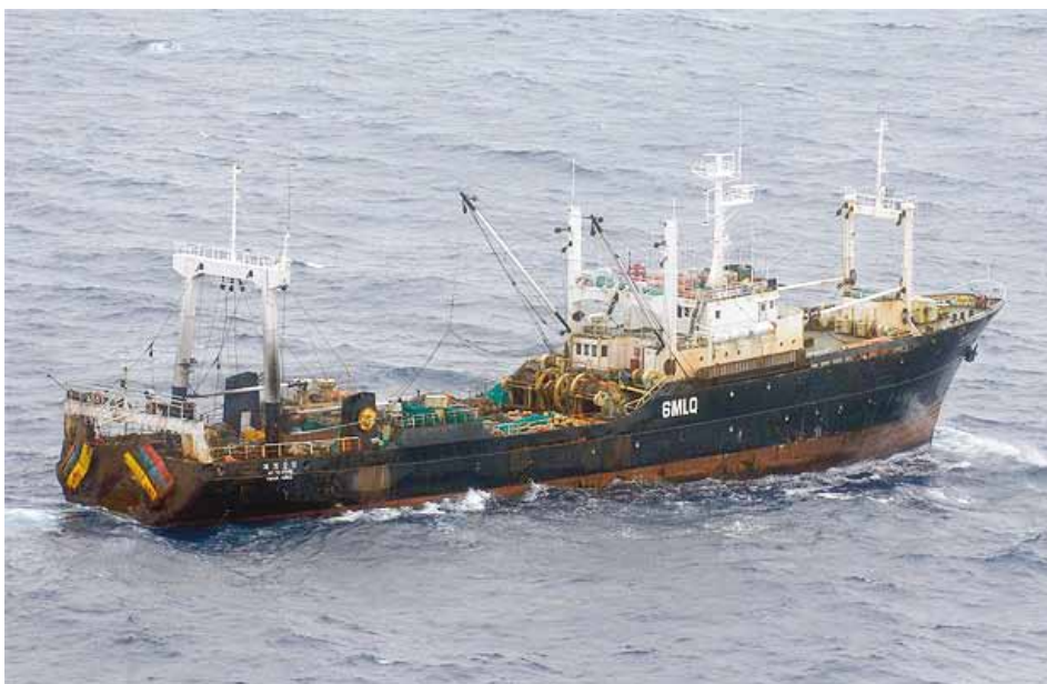
The Oyang 70 fishing vessel sank in the Southern Ocean in August 2010 with the loss of six lives in dubious circumstances. Survivors were brought to Lyttelton where claims of underpayment by surviving Asian crew investigated.

9 Indonesian fishermen from Korean fishing vessel Marinui jump ship in Dunedin, claiming severe physical and mental abuse. Crew were being paid US$6 per day. Repatriation and back pay organized.