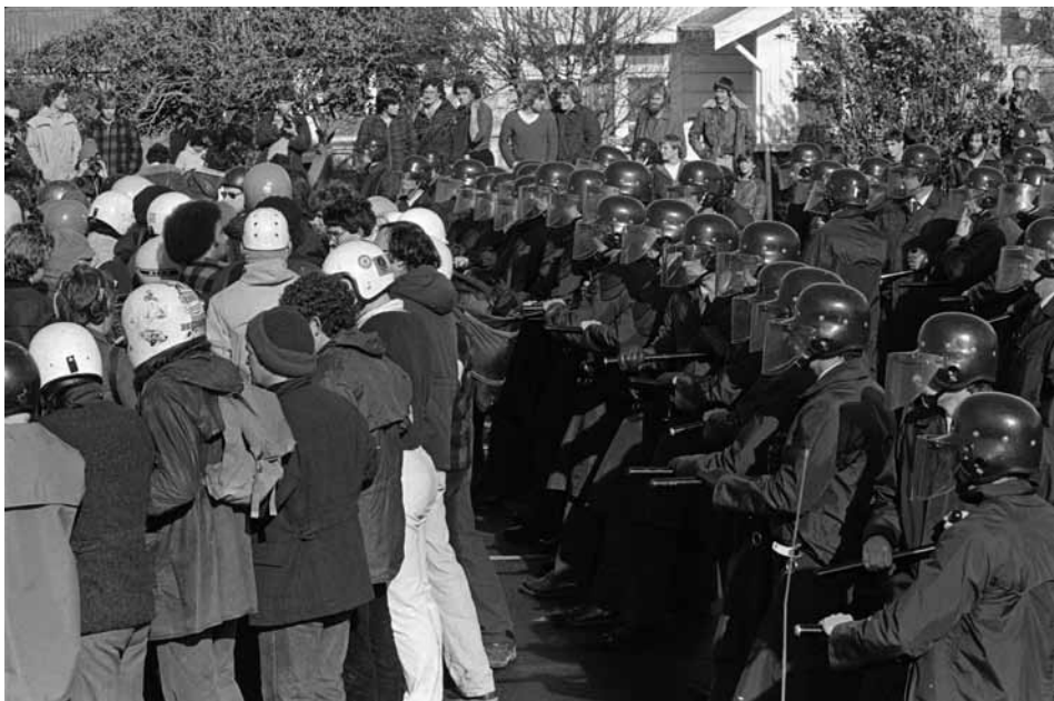
Demonstrators against the Springbok rugby tour turn away from police in Cuba Street, Palmerston North, 8 August 1981

Nelson Mandela recalled that when he was in his prison cell on Robben Island and heard that the game in Hamilton had been cancelled, it was as 'if the sun had come out'. (NZHistory.net)