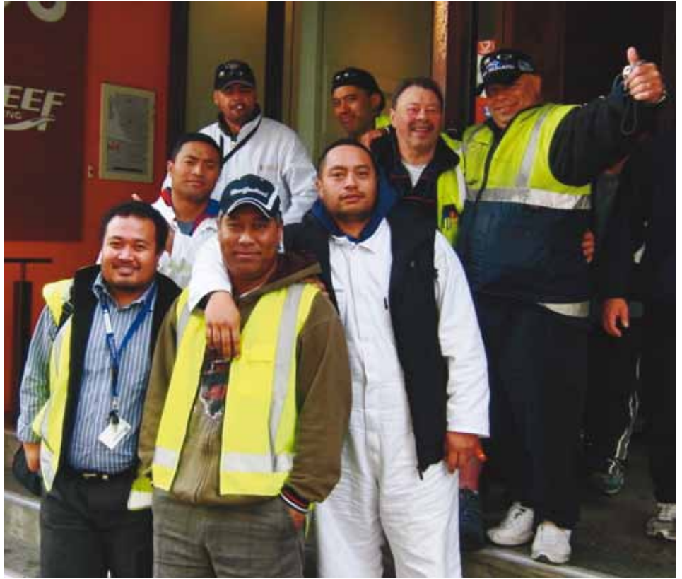
Maritime Union of New Zealand Local 13 members at their September 2011 stopwork meeting