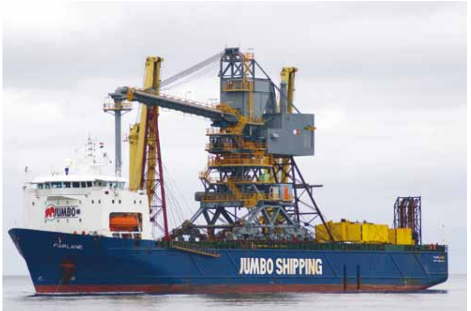
A new ship unloader arrives in Bluff in August 2011 for the Tiwai aluminium smelter. The unloader will replace the previous one which discharges at 230 tonnes – the replacement is capable of 1000 tonnes